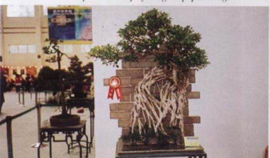
Ficus microcarpa on the wall.