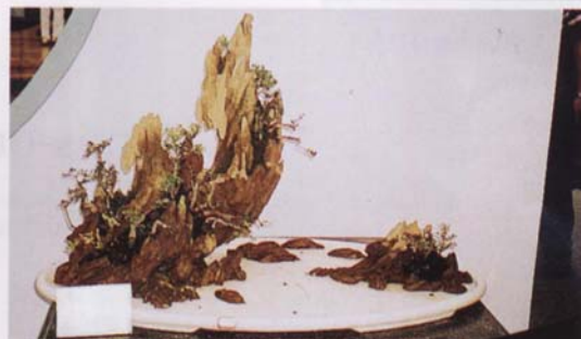
Rock Penjing displays.