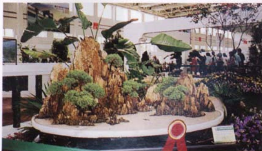
Eye catching Rock Penjing displays.