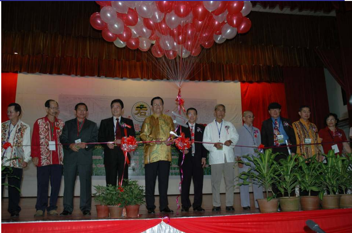
Opening ceremony for the Exhibition.