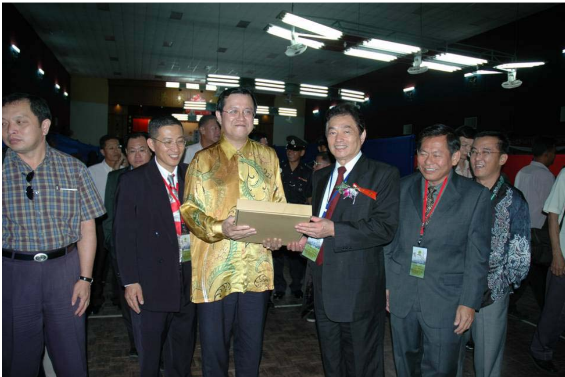
Handing out give-away of the exhibition.