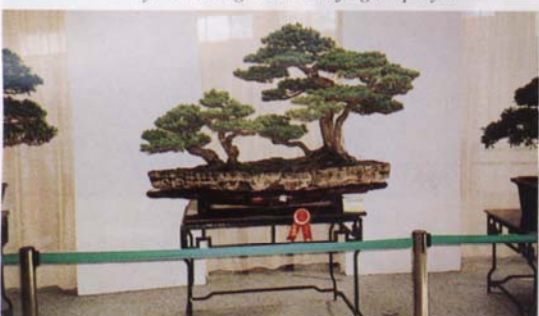
Podocarpus macrophylla group planting.