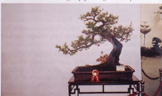
Sagretia theerzans. Pot 100 cm plant height 100 cm.