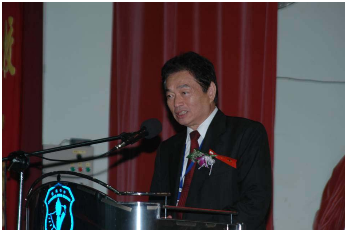
Su's giving speech

I will organize a group of 14 people as the Bonsai and Suiseki VIP tour to visit China (10/1~10/8)