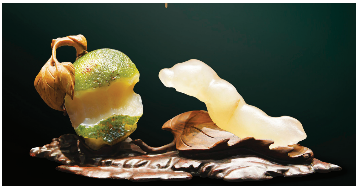
More than 1300 penjing and viewing stones will be on display at the BCI Annual Convention Exhibit in Shuyang, the largest penjing exhibition in Chinese penjing history.