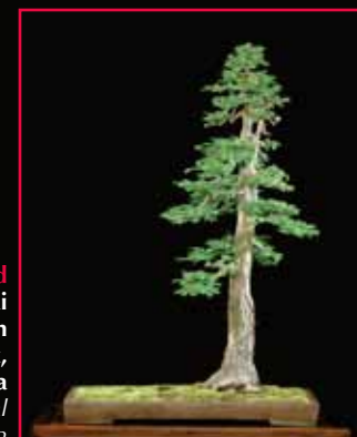
Coast Redwood Golden State Bonsai Federation Bonsai Garden At Lake Merritt, Oakland, California 2008 1 ST U. S. National Bonsai Exhibition