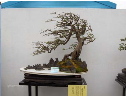
More trees outside in the garden