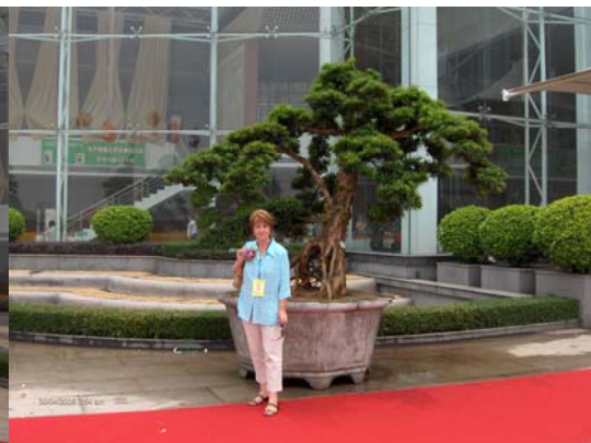
Some of the amazing, huge Bonsai outside