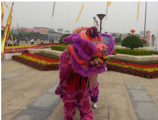
A welcoming Dragon

Below are some photos to share some of the highlights of an actioned packed 5 days, I will include more in future newsletters.