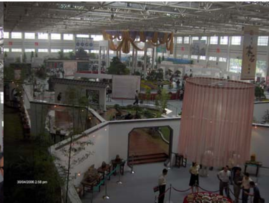
An aerial shot