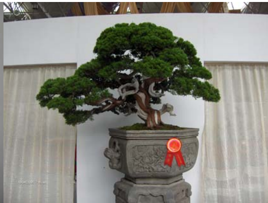
Trees – Trees - Trees