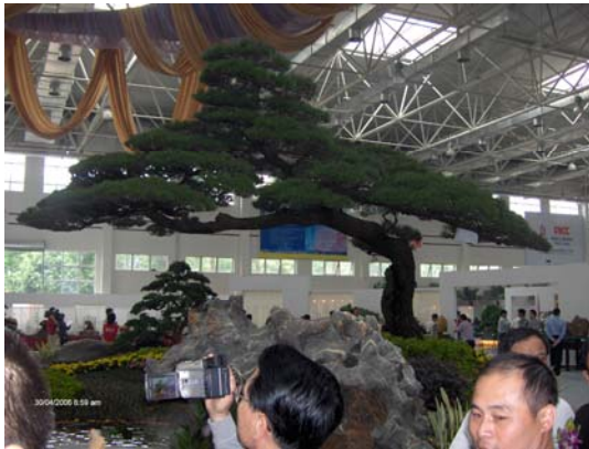
First glimpse of the exhibition