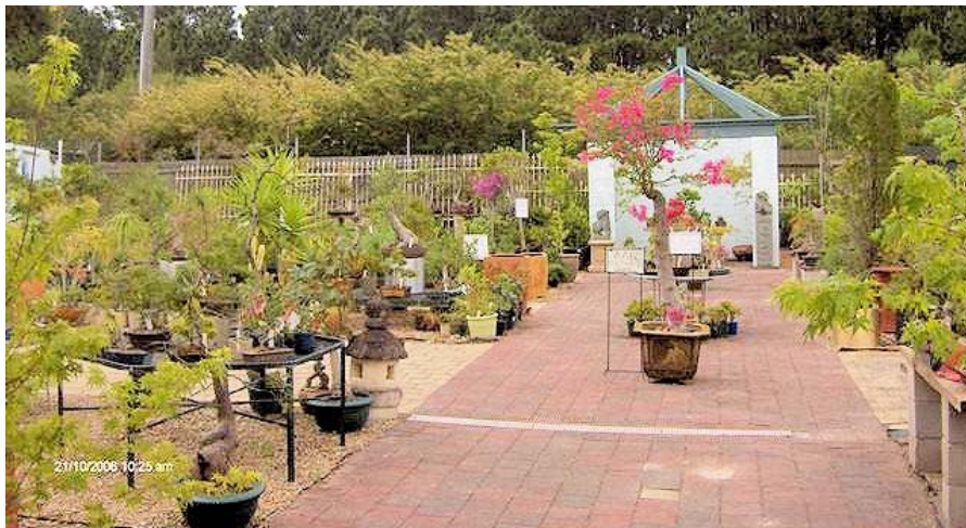
Stunning - shots of the nursery.