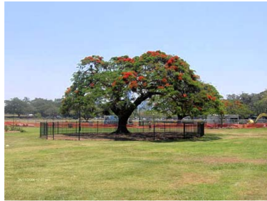
Not a Fig but a fantastic tree