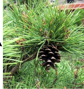
This fabulous specimen comes complete with pine cone.