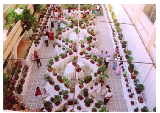
An aerial view of the display