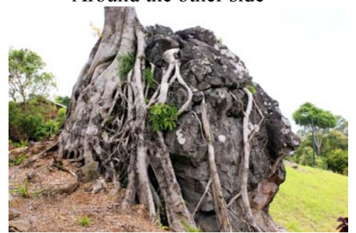
Another close up