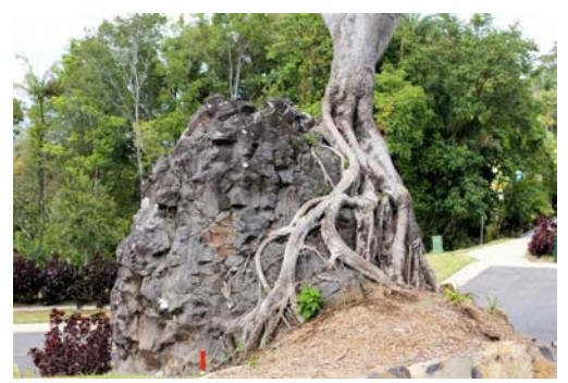
A close up of the root structure

Found this amazing natural Root over Rock in a town north of Brisbane – Buderim, wouldn't you love this in your front yard?