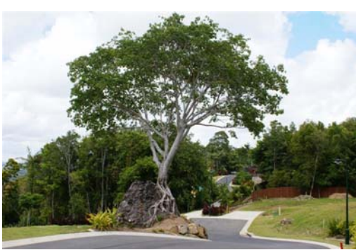
A distant view