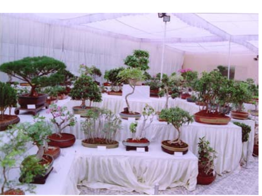
A view of the exhibition