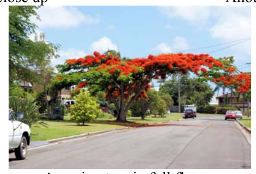
Amazing tree in full flower