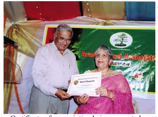
Certificate of appreciation being presented