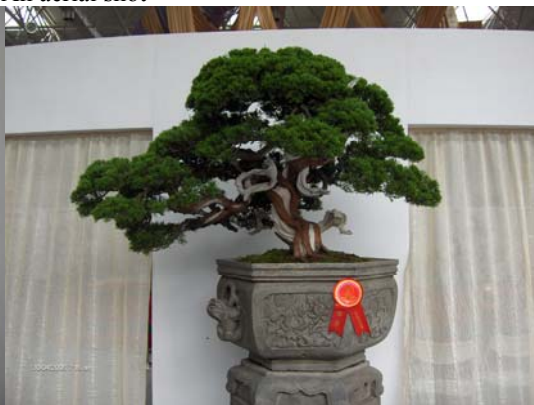
Trees – Trees - Trees