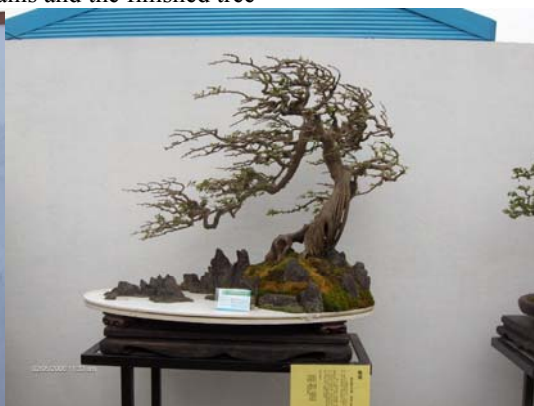
More trees outside in the garden