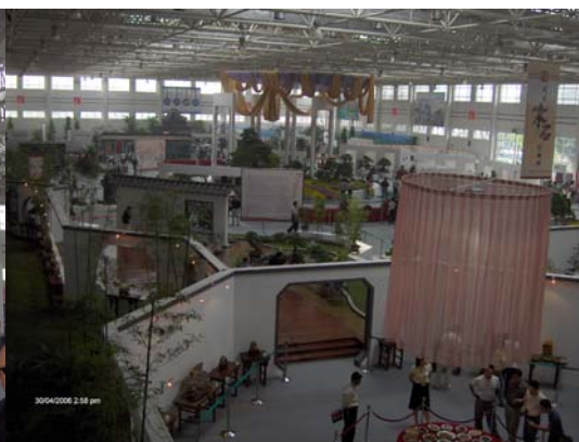
An aerial shot