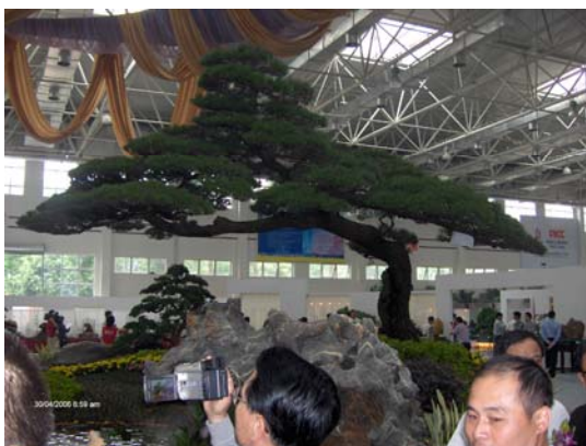
First glimpse of the exhibition